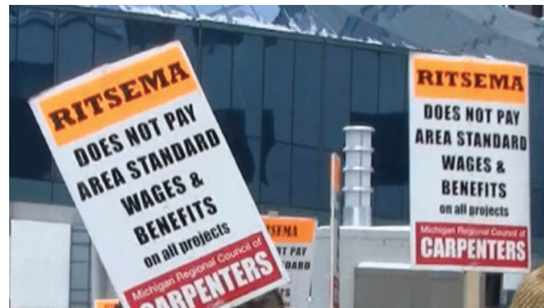
Protesters outside Ritsema Construction sites.