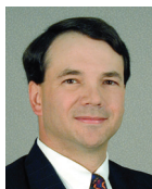
BY JOSEPH G. LEHMAN

The following is an edited version of a commentary that appeared in Dome Magazine (www.domemagazine.com/features/cov03113) on March 19, 2011, 10 weeks into Gov. Snyder's term.